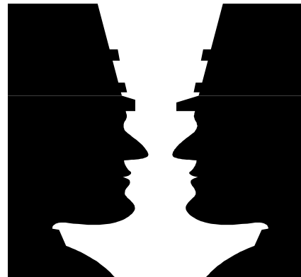
Figure 1: Data or Software?

Data reverse engineering (DRE) grew up through two different (and for the most part exclusive) communities: 1) the database community and 2) the software engineering community. The way DRE was performed and which aspects of DRE were emphasized differed as much as the focus of the two communities differed. To illustrate, we can use the technique of “figure/ground” shown in Figure 1. What do you see: Vase or faces--Data or software?